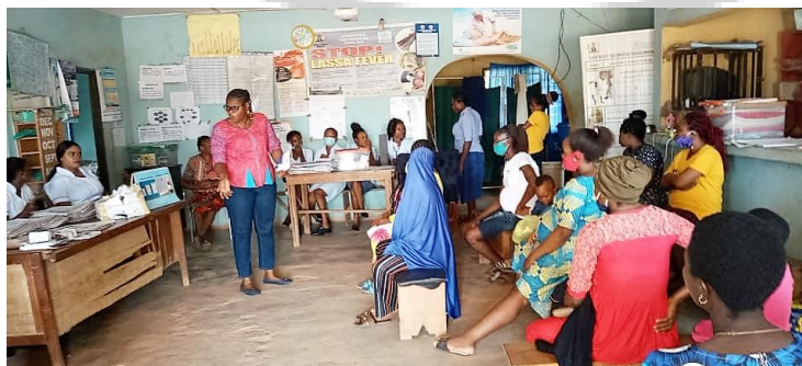
SMs from Esan West LGA. BoT Member facilitating an Outreach of TB at a Ujoelen PHC