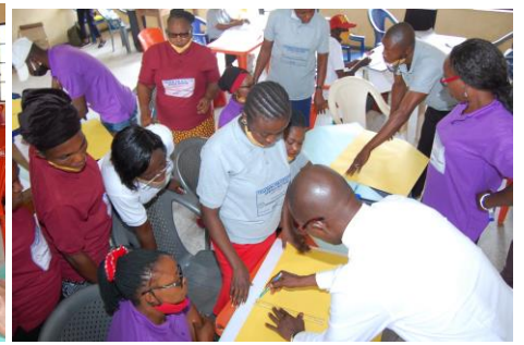
TESD Teacher display her work and some session goes on.