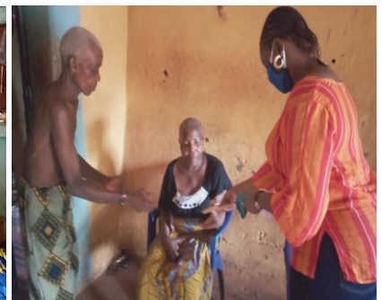
Giving Palliatives at Amahor