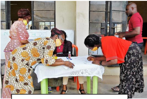
TESD Registration at Igarra