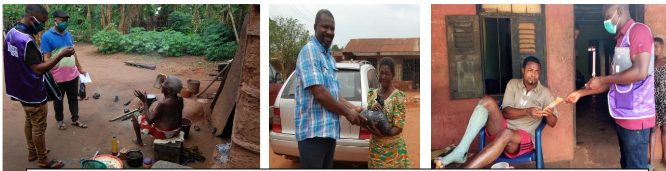
L-R; Administration of financial and material Palliatives at Esan West (Urohi and Ekpoma) Igueben.