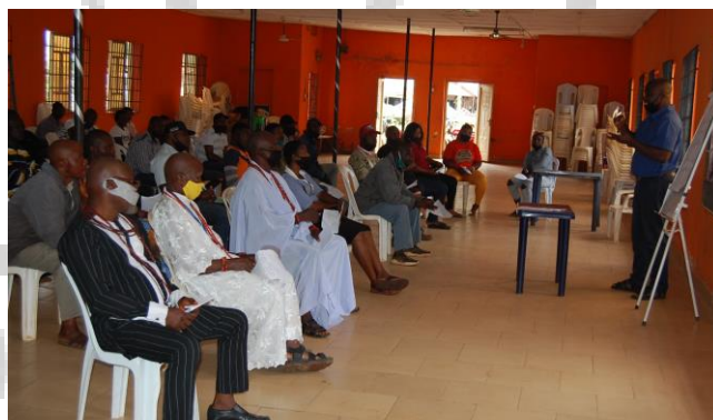
Capacity building on Citizens Accountability for some community stakeholders in Ekpoma