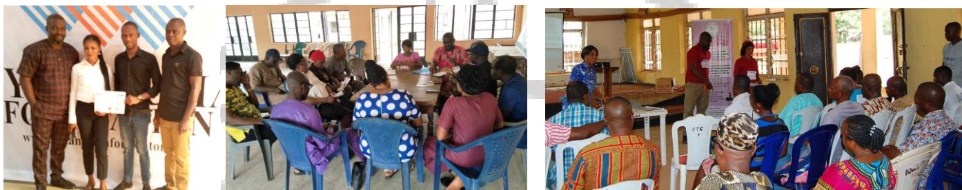
L-R: Contract award in Benin. Inception meeting with Management of Akoko Edo LGC & Training of SBMC members