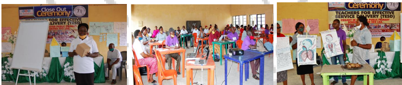
Various Practical Sessions involving the participants