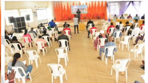
Scenes from the drama and lecture presentation at the event.