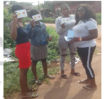
TCI SM at Work in Igueben

October 19, 2020, hoodlums visited our office and went away with several items including Optimo Projector, Plasma Tv. Start Times decoder, Table refregirator, Lacer pointer, table clock, letterheads, etc. Pictures after the incident. Nothis was recovered.