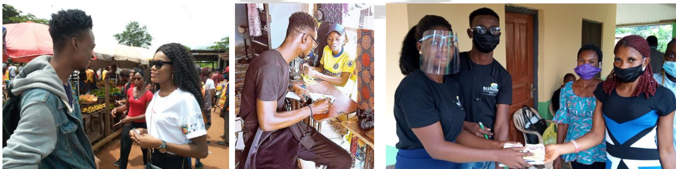
L-R: Some social mobilization and distribution of Go Cards to SMs in Etsako West LGA.