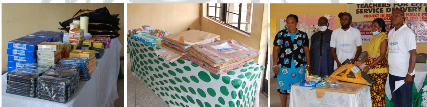
Cross Section of some items presented to schools. Snap shot with a benefiting school with TYDF