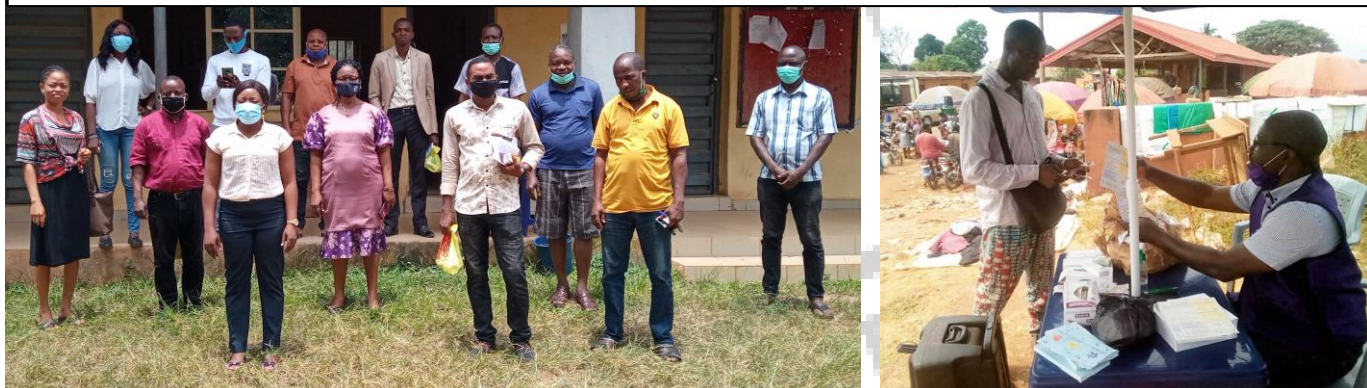
L-R: Training of PPMVs from Esan West LGA. CRO interacting with a client during an outreach at Okalo, Igueben LGA