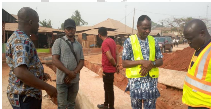
L-R: Inspection of Road Works