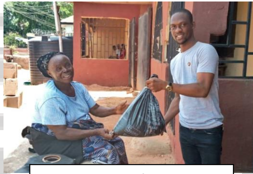
Administration of palliatives